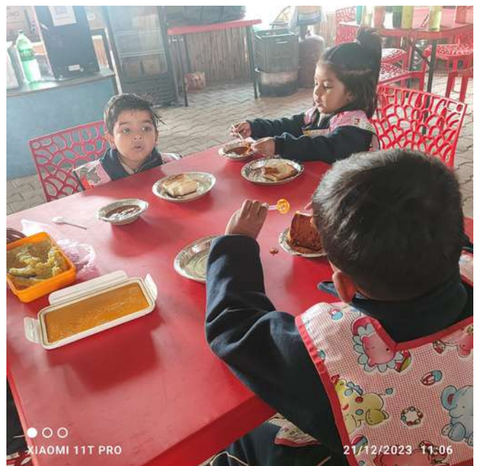
MERRY X'MAS, EVERYONE!!