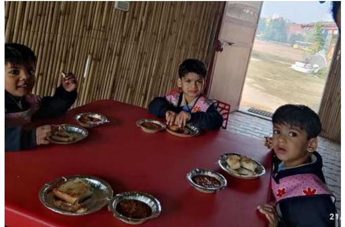
X'MAS BRUNCH WITH MY GROUP