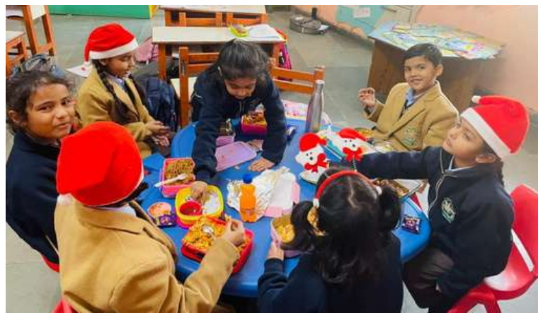
WOW! YOUR FOOD LOOKS YUMMY, MY PAL!