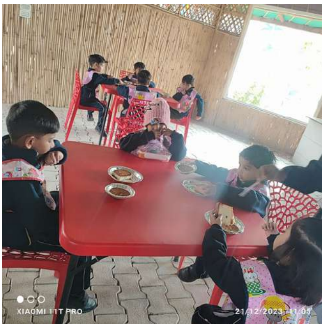
I WILL SHARE MY FOOD WITH YOU, X'MAS OR NOT!