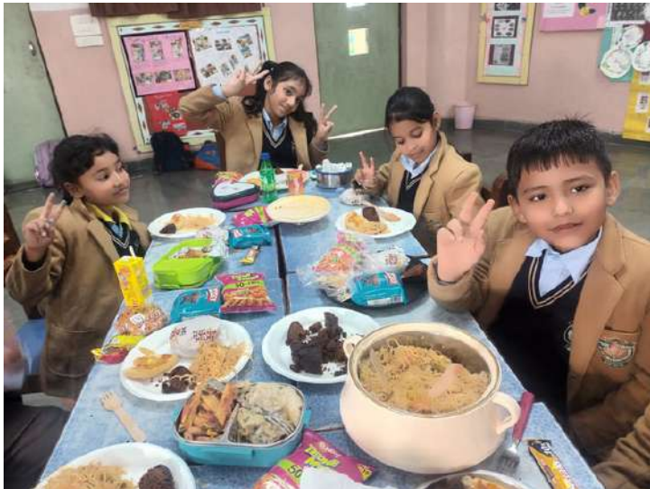
LET'S MAKE THE BEST OF THE FESTIVE VIBE