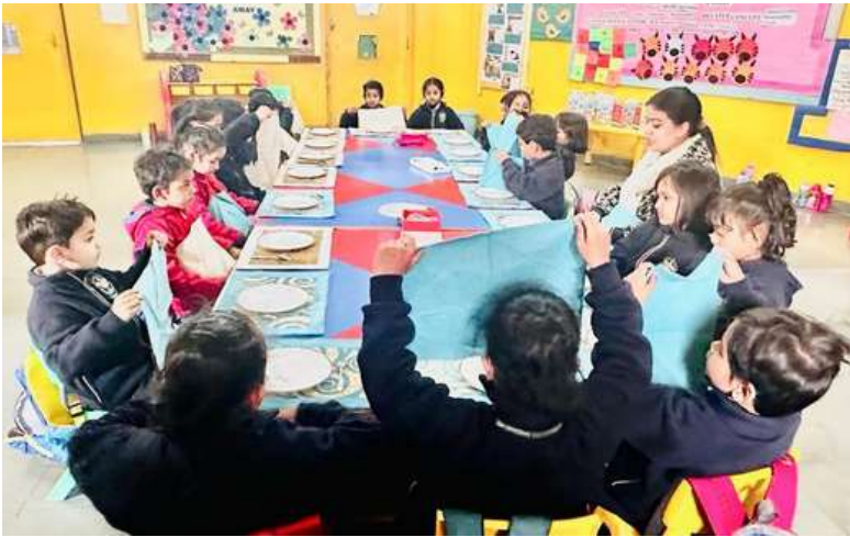
LET'S GET THE TABLE SET UP !